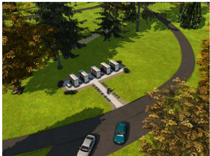
Rendering of the columbarium layout